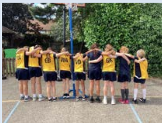
Well done to the girls Netball team for playing so well against Laleham