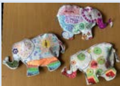
Year 4 have been decorating elephants using rangoli patterns

Despite the warm weather, we were able to welcome the new Reception children for their induction sessions. These took place on Tuesday and Thursday after school and it was great to see the new children and their families starting to get used to the setting. We will see them again on Tuesday for the 'Move Up' morning.