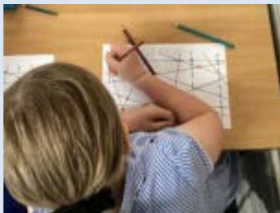
Year 3 have been learning about angles in Maths

There was a positive PTA meeting on Monday evening. It was a great opportunity to talk through the money raised so far this year and also consider plans for the summer fair. This is now two weeks away and there is a lot of hard work that has gone into it already. I know that the PTA team is appreciative of the support received so far but it's always helpful to have more. If you would like to play your part - please see the section below.