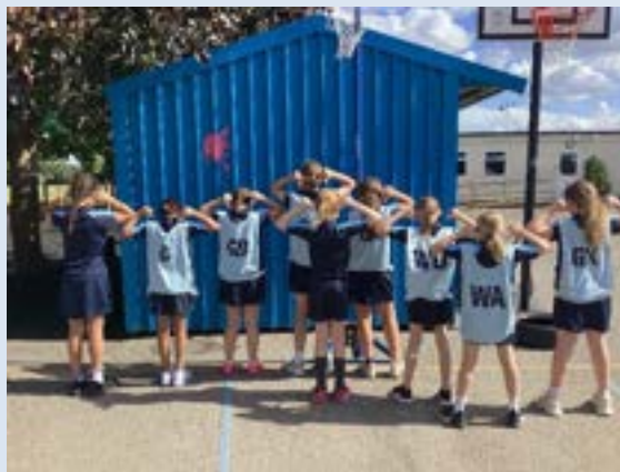
Our netball team showing off their new kit!