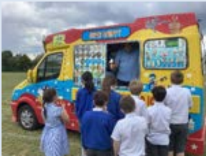
Year 6 enjoyed their end of SATs treat today

The children in the Nursery certainly enjoyed their special visitors on Wednesday. Despite some very strange weather – the mobile farm visit made a positive impression. I know that lots of children were talking about the animals and will remember the first-hand experiences that this offered.