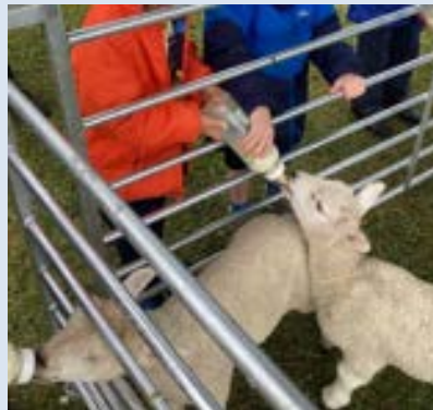
Our nursery children really enjoyed their farm visit!