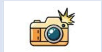
Remember to order your class photos

It was great to be part of the Riverbridge team of runners on Sunday. It was lovely to see so many children and families cheering on the crowd of joggers. The support certainly helped and I know that the PTA are grateful for those that ran and also those that marshalled. The PTA will also be very thankful for the volunteers that will be supporting the discos next Wednesday. I am sure the children will have a great time!