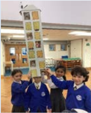
Well done to the children who took part in Battle of the Books