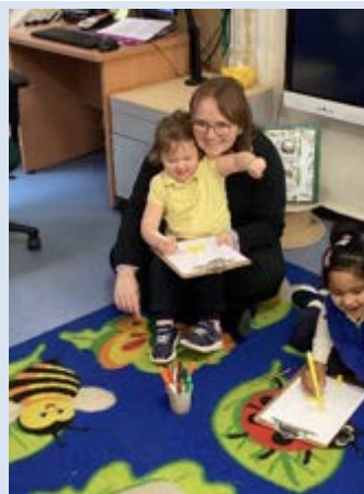
Nursery had so much fun welcoming their grown ups to Stay, Play & Learn this week