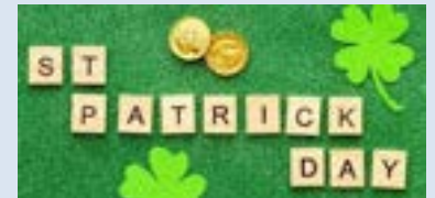
Children who are part of a uniformed organisation are able to wear their uniform on St Patrick's Day (Thurs 17 th March)

This week was also Science Week and I have seen some really interesting learning taking place. I am sure some of you have already heard about this from your children.