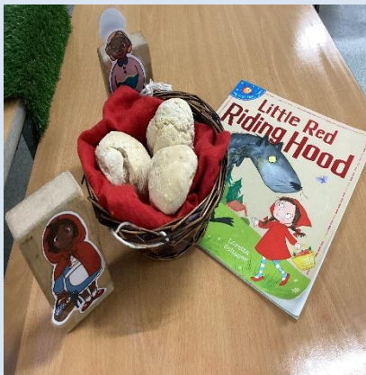
Bread baked by the nursery children.

Whilst I understand that the cost of uniform is not cheap - it is not optional. I have also noticed a growing number of children that are in trainers and this is not in our policy. Class teachers will be making contact next week where improvements may be necessary.