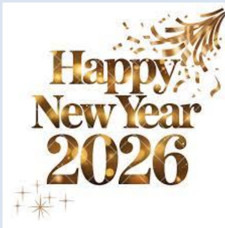
We hope you had a lovely Christmas & Happy New Year!