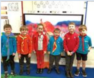
Year 1 looking smart in their uniforms for Remembrance day

Finally, today we have donned spotty clothes to help us think about Children in Need. This has been another opportunity to think about those less fortunate and how we can show compassion towards others.