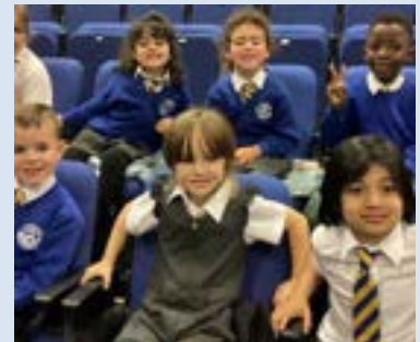
Year 2 had a brilliant time at the Pantomime

As a school, we are constantly thinking about how to support children with their online safety. In recent weeks there have been instances where children have forgotten some of the basics around digital communication.