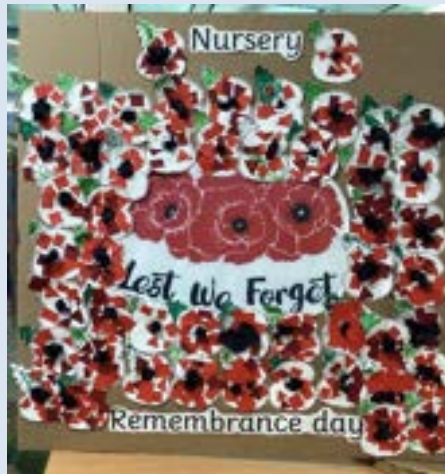
Nursery made a wonderful wreath to celebrate Remembrance Day