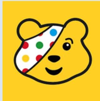
Children in Need, Friday 14 th November