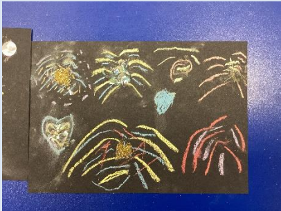
Year 2 have been drawing fireworks

I am sure there will be a lot to talk about this topic in next week's Review!