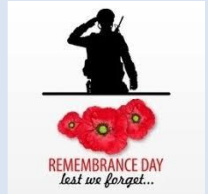
Remembrance Day, Tuesday 11 th November

Thank you to all that completed the annual parent and carer questionnaire. Today is the deadline so if you have yet to share your views – please do so before the form closes tonight. It is really useful to hear your views: good and bad. We will then use them to work out what we potentially need to do more of, less of and maybe change too.