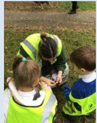
Reception enjoying their Autumn walk

Next week's parent and carer meetings are almost upon us. These are such an important opportunity for the teachers to share how your child has settled, what we are working on in class and what you can do at home to support. The expectation is that all parents and carers will book a meeting. If you are unable to attend, or there are limited slots left, we will always try to arrange an alternative meeting after half term. Please contact the school office if you still would like to book a slot.