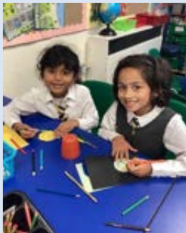
Year 1 & 2 during World Space Week

I have been pleased to see the school's attendance continuing to look positive at the start of the year. The Autumn term is one when children can get coughs and colds but these don't necessarily require time off school. Obviously, if a child has a sickness bug – vomiting or diarrhoea – they cannot attend school for a 48-hour period. For those children that are a little under the weather, they can attend school and we will monitor them closely. If we feel that a child is not well enough to be in school, we will always contact you. Thank you for continuing to make your child's attendance a priority.