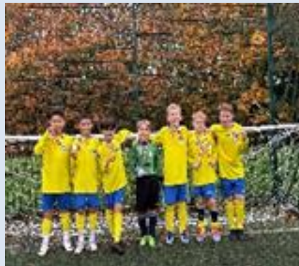
Year 5 Boys' Football at their tournament