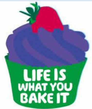
A big thank you for all of your donations to our MacMillan coffee morning!

Last week I failed to add a couple of important pieces of information to the Review. One was to share these Year 6 children that have been given extra roles and responsibilities. These were shared in last Friday's assemblies and the children have already made a positive impression and are being very enthusiastic in their new role. Well done to them too: