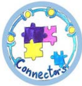
Being a 'Connector' is one of the 8 great ways of being our best