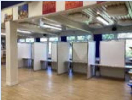
Voting for the Riverbridge School Council took place this week