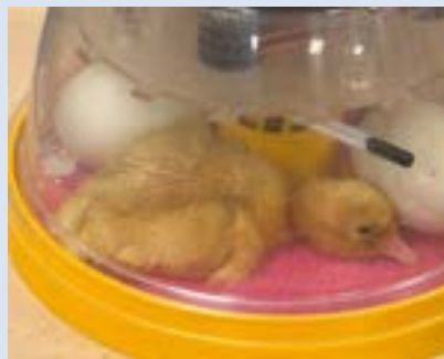
Newly Hatched Ducklings