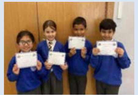
Year 2 at Battle of the Books