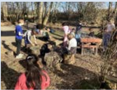
Year 5 at Bowles