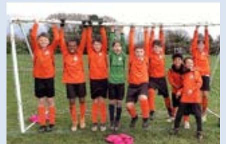
Winning Boys' Football Team

Parent and carer meetings are two weeks away. Please make sure that you read the section below and book yourself a slot. As we are approaching the half way point in the academic year, these meetings are more important than ever. They are a great way to find out the successes your child has had and also what the next steps are. I look forward to 100% attendance.