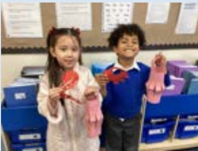
2C made paper lanterns for Chinese New Year

Whilst we offer children rewards for positive behaviours – not least the gold leaves that I love to read – it is important for the children to want to succeed without the carrot of a reward. I always talk to every child that presents a gold leaf to me and ask them what they have achieved this week that makes them feel proud. It is this 'warm feeling' you get inside when you have done the right thing or completed learning to the best of your ability that is more powerful than a sticker or financial reward at home.