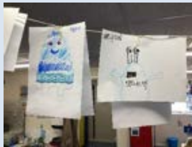
1C's 'Bog Baby' blue creatures