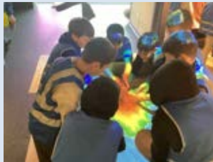
Year 6 in Bristol