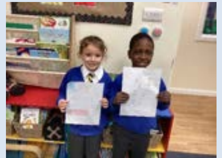
2C Road Safety Week posters