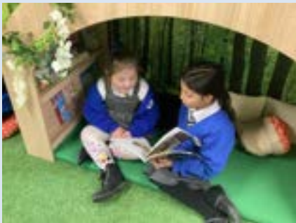
Enjoying the renovated KGB Library on Children in Need

Whilst a lot has been going on in school – there has also been events farther afield. The group of Year 6 children who have ventured to Bristol have had a good time so far. The weather has been chilly but there has been enjoyment aplenty. I am looking forward to the children's safe return and hearing about their exciting adventures.