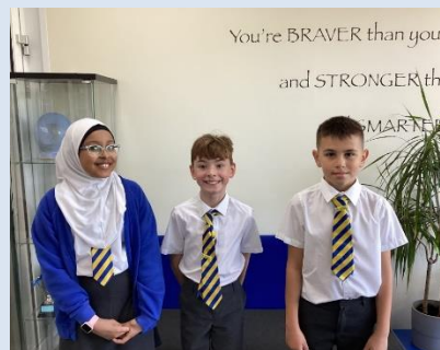
Year 5 School Council