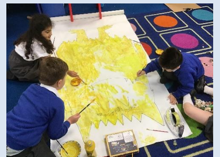
RBT's giant yellow colour monster

There have been a number of reports into school about confrontations between motorists outside of Park Avenue this week. We have been made aware of inconsiderate parking and aggressive driving which has resulted in verbal arguments. In both instances, we have recommended that if parents feel uncomfortable about an altercation that the police be called. Whilst we understand we have a duty of care to ensure the safety of everyone who comes onto the school site, our primary aim must be to ensure the safety and education of the children. If there are adults within the wider local community that are unable to manage their emotions in a reasoned way, perhaps speaking to the police might help. The events of this week are disappointing to hear and I am ever hopeful that I will not need to write about this again over the course of the academic year. Thank you for your help and understanding here.