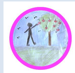
Being independent is one of Riverbridge's 8 Great Ways to be our best