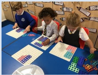
Multi-link cubes and numicon in Reception