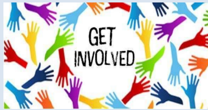
Join our PTA