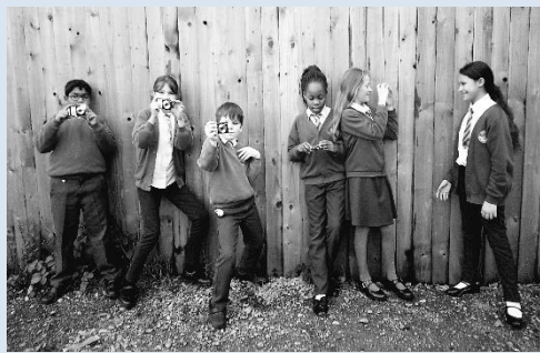
Autumn term's Art Club trying out the school's new cameras

'Please do not let minor problems become major ones. Come in and talk to us and together we can usually sort things out. Please see your child's class teacher initially as soon as possible to discuss your concern. If more help is needed in addressing the concern the relevant year group leader, our Deputy or our Headteacher are always happy to meet with parents to discuss issues'.