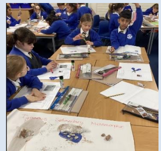
Science with Year 3

It was good to be part of the PTA meeting this week and start to put together the plans for the remainder of the year. Whilst there have been a few new faces taking part in PTA events recently, we still need more volunteers. If one of your 'New Year resolutions' was to give a bit back to the community, why not come along and volunteer at one of the many events that are in the pipeline for the rest of the year. You will certainly enjoy the experience.