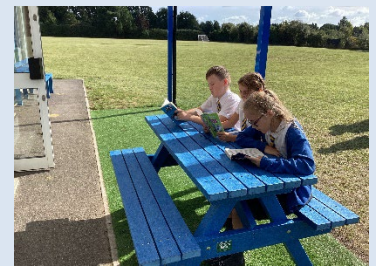
The Year 6 shelter has been one of the PTA's fundraising goals

Our focus on emotion coaching and wellbeing continues. There is a leaflet attached to this week's Review which might help any children that may be experiencing worries around school. There are some practical things that you can do at home to support but the most important thing that you can do is to model your expectations clearly and remain consistent with them.