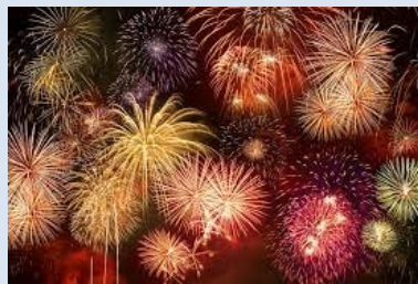
Fireworks Night is this Sunday