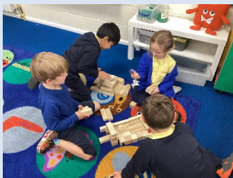
1L demonstrating teamwork

It is worth noting that being late after the register closes counts as an absence. To avoid this please aim to get to school and through the school gates by 8.40am . The gates on both bases close at 9.00am.