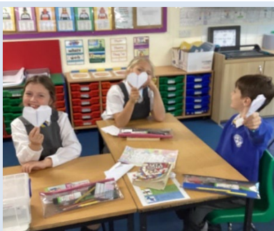
4P enjoying coding

The role of the PTA in any school is an important one and we have been really lucky to have such a hard-working and committed team of volunteers. The PTA are always looking for additional parents to volunteer time, support and skills. I would ask all parents to consider how they can play their part in PTA events and help continue the excellent fundraising efforts seen over recent years.