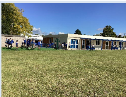
Year 6 outdoors- before the rain