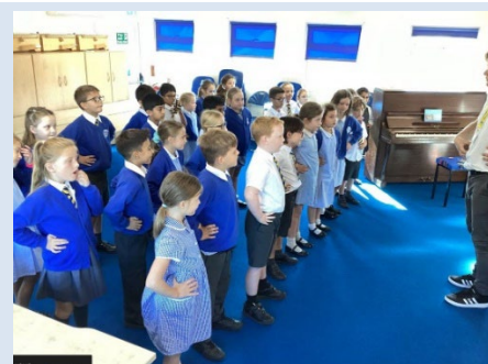
Year 3 singing with Primary Robins